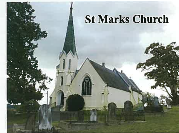
St Marks Church

Deloraine is a delightful riverside town with an historic streetscape classified by the National Trust.